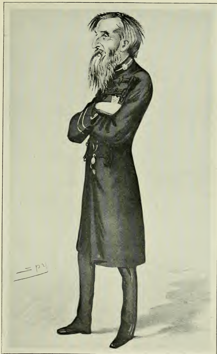
A CARTOON PUBLISHED IN VANITY FAIR (1882)